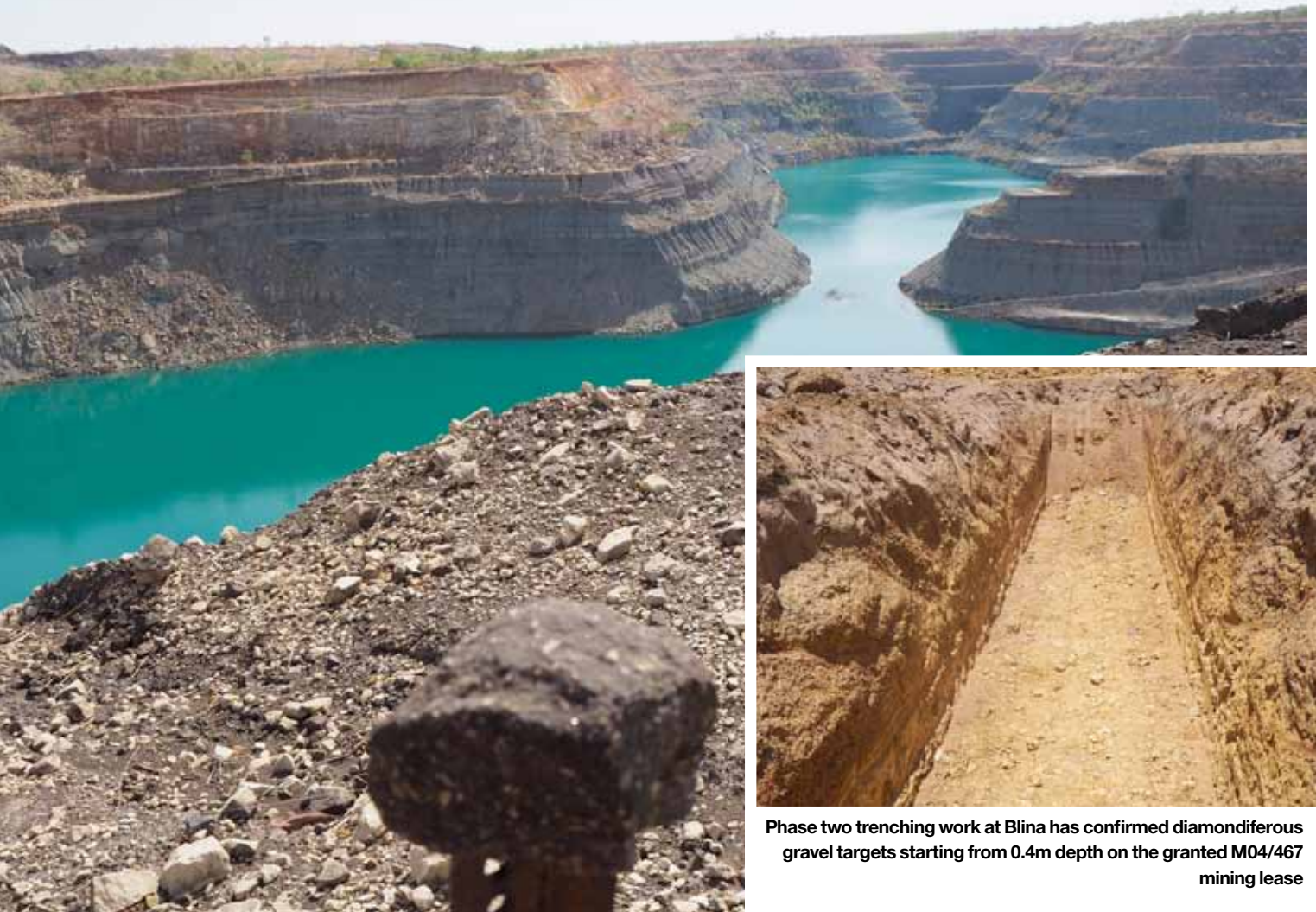
Phase two trenching work at Blina has confirmed diamondiferous gravel targets starting from 0.4m depth on the granted M04/467 mining lease

The WA Government has also invited India Bore Diamond Holdings to apply for other tenements at Ellendale