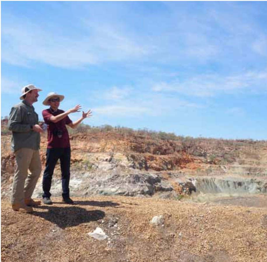
Gibb is looking to raise in the order of $2.5 million